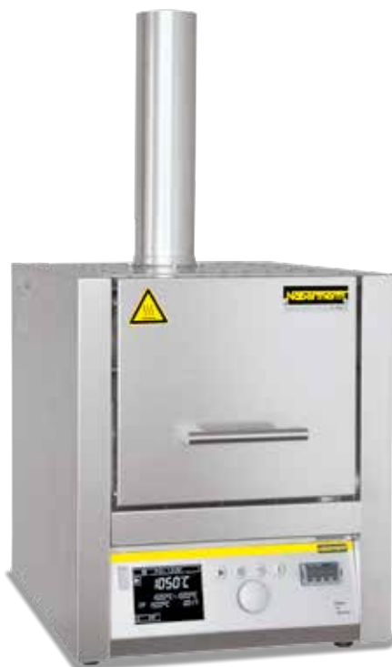
Ashing furnace LVT 5/11