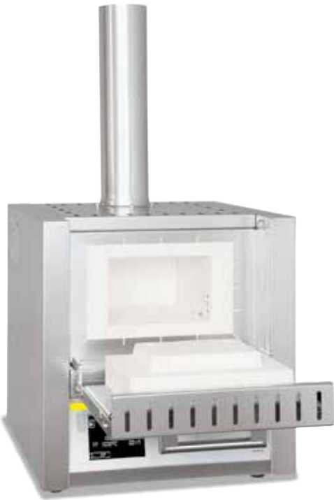
Ashing furnace LV 3/11

Ashing furnace LV .. /11 is designed especially for ashing processes to 1050 °C in the laboratory. Applications include determining loss on ignition, ashing food and plastics for subsequent substance analysis. A special fresh-air and exhaust air system ensures that the air is replaced 6 times per minute so that there is always sufficient oxygen for the ashing process. Incoming air passes the furnace heating and is pre-heated to ensure good temperature uniformity.