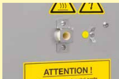
Ashing furnace LV 5/11 with port for thermocouple in the rear wall of furnace