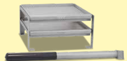
Charging trolley to load the furnace in different levels