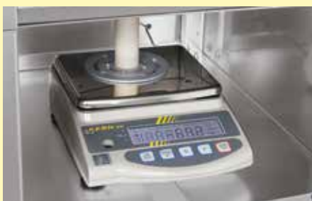
4 scales available for different maximum weights and scaling ranges