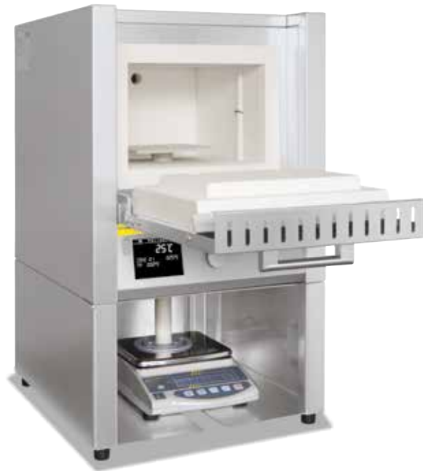
Weighing furnace L 9/11/SW with flap door

This weighing furnace with integrated precision scale and software, was designed especially for combustion loss determination in the laboratory. The determination of combustion loss is necessary, for instance, when analyzing sludges and household garbage, and is also used in a variety of other processes for the evaluation of results. The difference between the charged total mass and the combustion residue is the combustion loss. During the process, the software included records both the temperature and the weight loss.