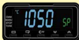
Example of an over-temperature limiter