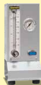
Gas supply system for non-flammable protective or reactive gas