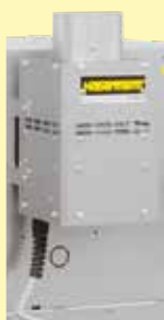
Chimney with fan

*Please see page 75 for more information about supply voltage