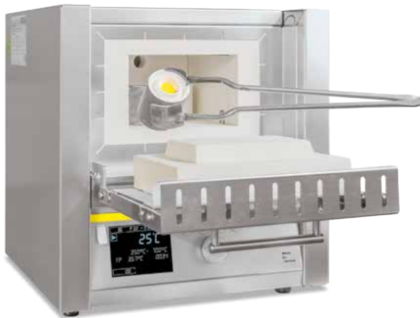
Muffle furnace L 3/11 with flap door