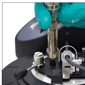
Inject 2ml sample