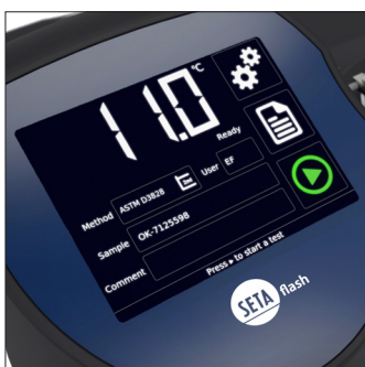
Select test temperature