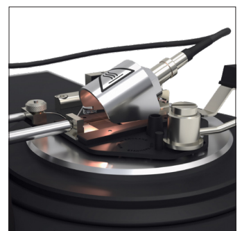
Automatic dip of ignition source and flash detection