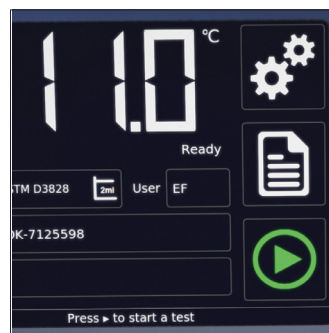
Press to start a test