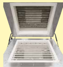
Floor and lid heating, two-zone control