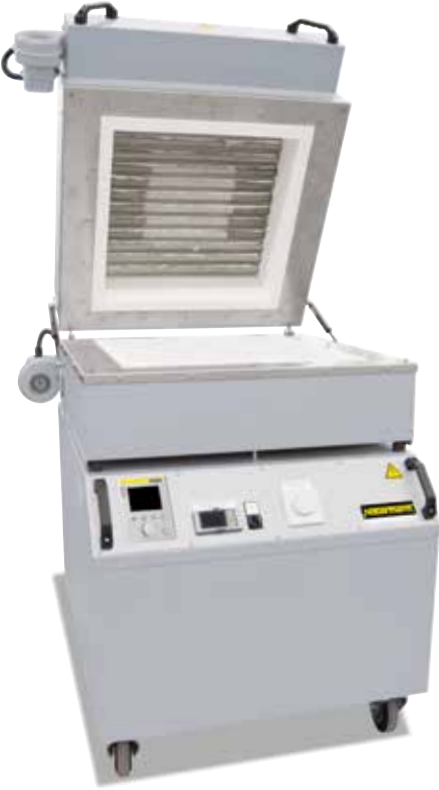
Fast-firing furnace LS 25/13

These fast-firing furnaces are ideal for simulation of typical fast-firing processes up to a maximum firing temperature of 1300 °C. The combination of high performance, low thermal mass and powerful cooling fans provides for cycle times from cold to cold up to 35 minutes with an opening temperature of approx. 300 °C.