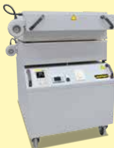
Fast-firing furnace LS 25/13

*Please see page 75 for more information about supply voltage