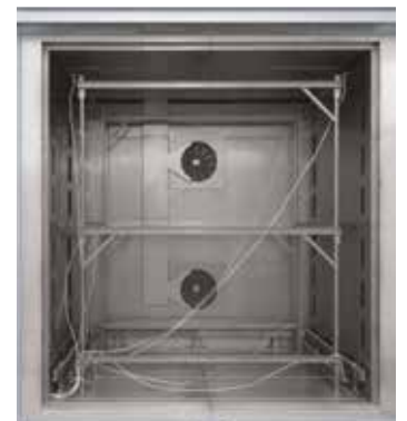
Pluggable frame for measurement for forced convection chamber furnace N 7920/45 HAS