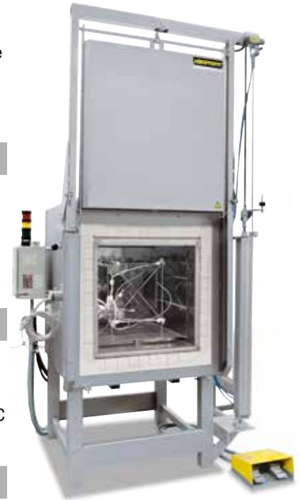
Holding frame for measurement of temperature uniformity

In standard furnaces, temperature uniformity is guaranteed as +/- K without measurement of temperature uniformity. However, as an additional feature, a temperature uniformity measurement at a target temperature in the work space compliant with DIN 17052-1 can be ordered. Depending on the furnace model, a holding frame which is equivalent in size to the work space is inserted into the furnace. This frame holds thermocouples at up to 11 defined measurement positions. The measurement of the temperature uniformity is performed at a target temperature specified by the customer after a static condition has been reached. If necessary, different target temperatures or a defined target working temperature range can also be calibrated.