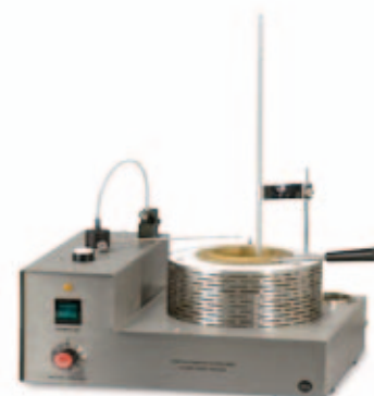
13811-3 (Thermometer supplied separately)